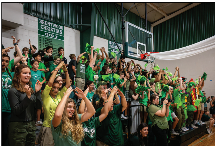
Rowdy and Ready BCS celebrated the kick off of the new Running of the Bears fundraiser with a pep rally on Oct. 1.

While some have expressed discontent with the idea of the name change and rebrand, the opportunity for new traditions blending with old through the power of giving and service promise to provide opportunities for God to be glorified through our school.