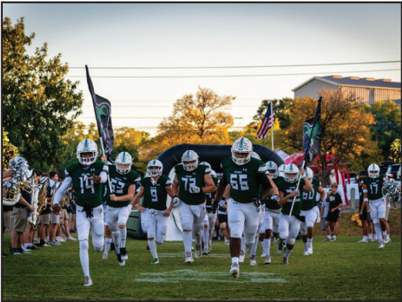
Ready for Anything The BCS football team, above, takes the field prior to the first district game against Grace Community School on Sept. 27.

Overall, the team is hoping to continue hit-