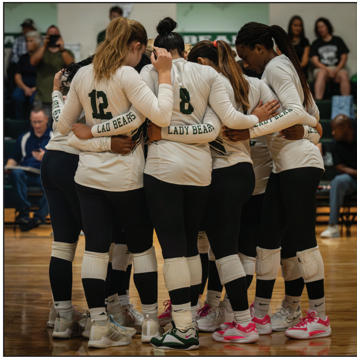
AI C! E! The varsity volleyball team huddles up to pray and support each other before starting a game.

The Brentwood Christian School volleyball team continues to exceed all expectations. The varsity team includes ten players consisting of six seniors, two juniors, and two sophomores who not only have amazing athletic ability, but have Christ-like attitudes on and off the court.