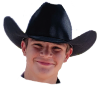
see page 4