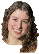
see page 4