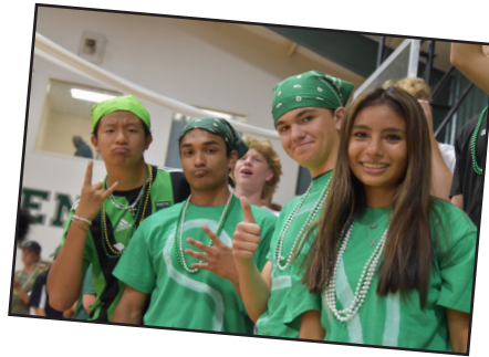
Spirit Song ✧ ✧ ✧

Homecoming week came to an exciting conclusion with football’s 49-14 win against St. Dominic Savio on Friday, Sep. 22 and the third annual homecoming party hosted by the Lady Bellas on Sep. 23.